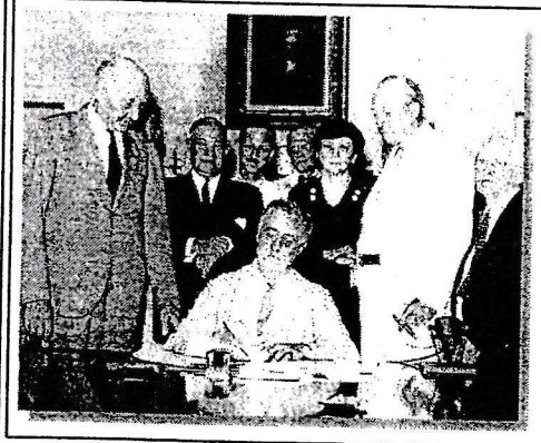
President Roosevelt signing Social Security Act of 1935 in the Cabinet Room of the White House.

The Voting Rights Act of 1965 was signed into law by President Lyndon B. Johnson. The Act suspended literacy, knowledge and character tests designed to keep African Americans from voting in the South. It also authorized the appointment of federal voting examiners and barred discriminatory poll taxes. The Act was renewed by Congress in 1975, 1984 and 1991.